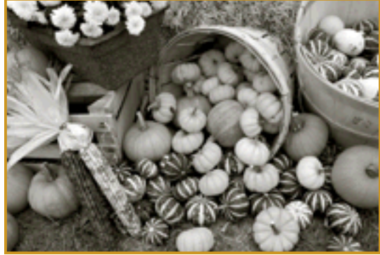
Harvest display, Westport, MA Fair.

in order to feed all of the guests. Many of the wild fruits were no longer in season though some may have been preserved and served. Winslow notes: “Here are grapes, white and red...strawberries, gooseberries, raspas (raspberries)...Plums of three sorts, with black and red.”