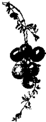
Gold leaf engraving on the cloth cover of Eastman: The Cranberry and its Culture, 1856.