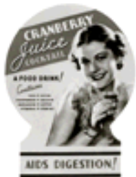
Counter-top, display ad for cranberry juice, circa 1940. — Ocean Spray Cranberries.

Combine the tea, juice, sugar and cinnamon in a microwave safe bowl or pitcher. Heat on HIGH for three minutes. Serve as directed.