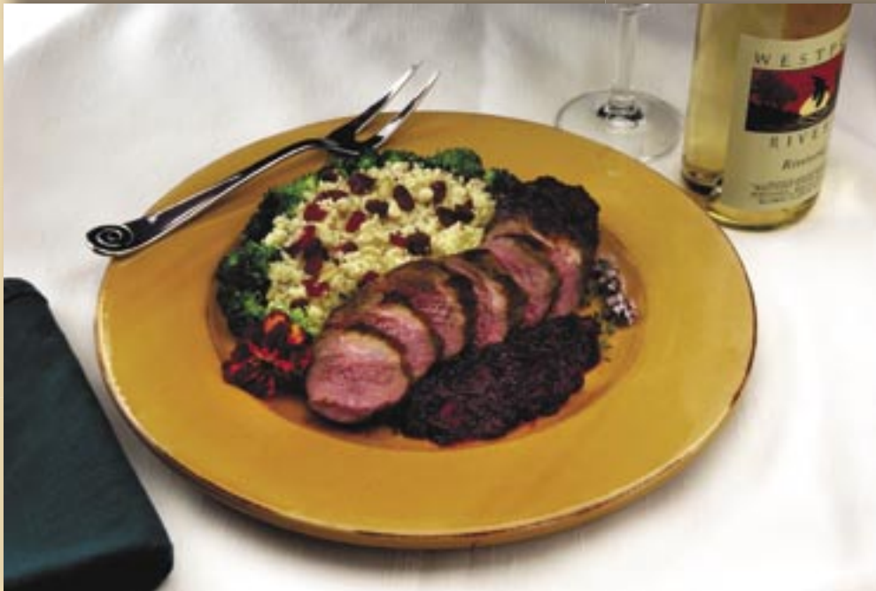
Tim Sylvia photograph