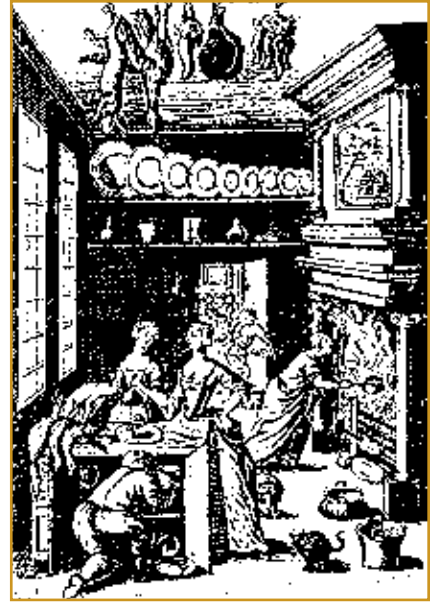
Frontispiece from 17th-century English cookbook.

So how did pumpkin pie, cranberry sauce, and turkey with stuffing become synonymous with Thanksgiving? They most likely came later. The next recorded Thanksgiving was called by Governor Bradford on July 26, 1623, a religious day to give thanks for an end of a drought. On February 22, 1631, settlers of Massachusetts Bay Colony in Boston celebrated the arrival of the ship, Lyon , with a day of prayer and thanksgiving. On September 18, 1639, the governor of Connecticut made a proclamation calling for an annual thanksgiving for “general causes,” to thank God for the safety of the colony and the bounty of the season. This became a seasonal custom, though the day was never the same; it came as an announcement by the governor. This custom spread throughout other parts of New England and continued for many years, even though the political picture in New England was changing during the mid-1700s.