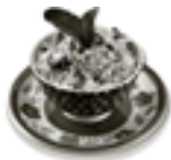
Couscous with Dried Cranberries (photo page 76)

Serve as a delicious side dish with lamb, poultry, or fish.