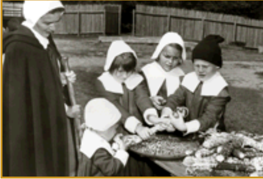
Plymouth Plantation Thanksgiving, 1962.