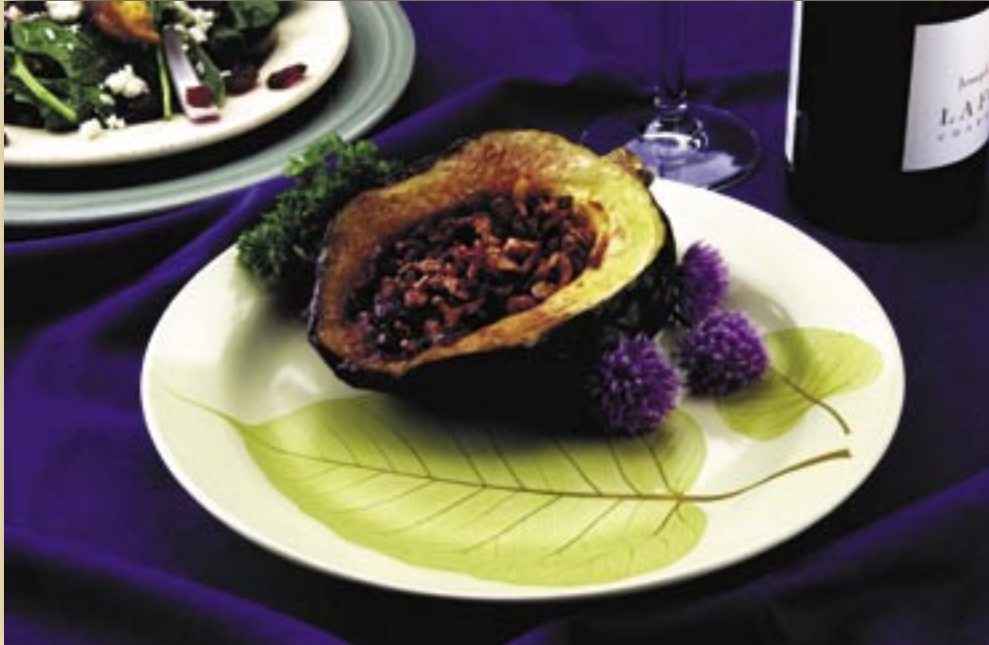
Tim Sylvia photograph